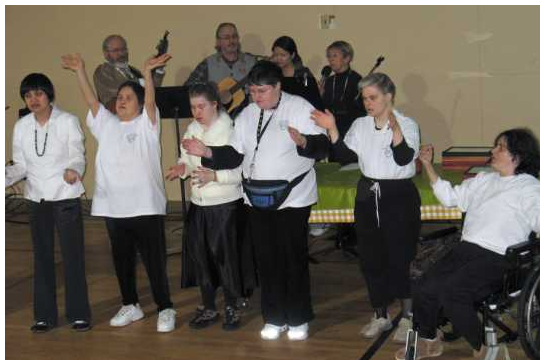
The Sign Language Choir

The meeting closed with more singing, refreshments, tea and coffee.