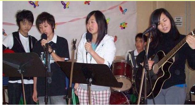
Bunaby Chinese Alliance Church Teen Band