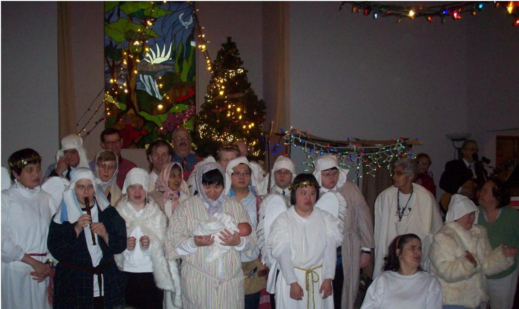
Cast of the 2009 Christmas Pageant

Christmas is a time of great joy for most of our folks, perhaps their favorite holiday of the year, even though it also can also often be a time of mourning loved ones. Anticipation of presents is certainly one of the most important factors, but in Joy Fellowship we have long been cultivating the centrality of the Christmas story, and the wonder of that day when Christ the Lord was born, and laid in a manger. For many if not most of our friends this is now at the heart of Christmas I believe.